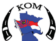
Karen Organization of Minnesota

နီနီဆိုးထေးကရင်ထေးဖျိုးသေးထေးညှိုးထေးရုံး ဗဟိုဌာန၊ ဗဟိုဌာန၊ ကလေးကလေး၊ ကလေးကလေး၊ ကျေးဇူးတင်အားပေးရန်အတွက်